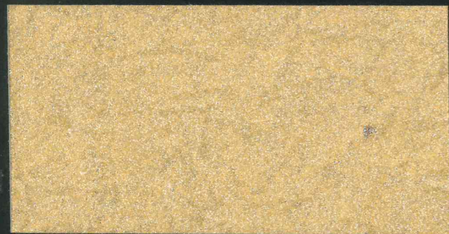
HK300 = 50\1L