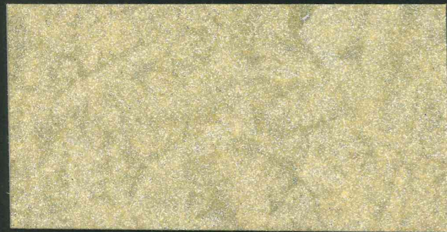
OC = 5 + N5 = 1\1L