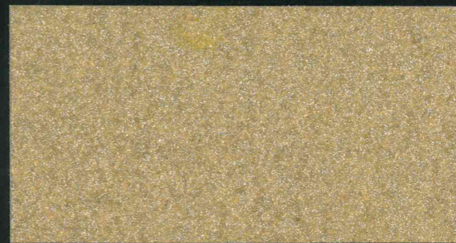
NP 88.2 on aracyl 215