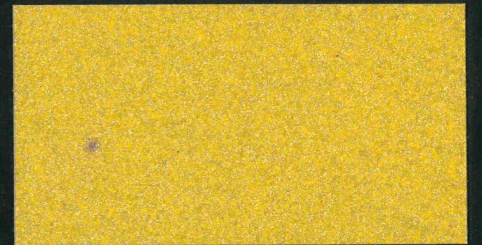
NP 9.2 on aracyl 231