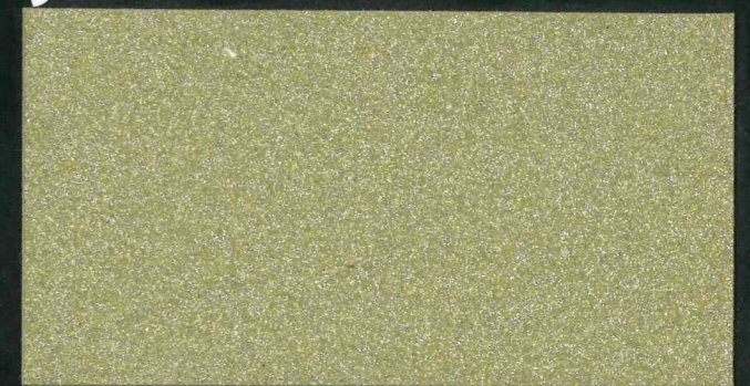
NP 9.1 on aracyl 241