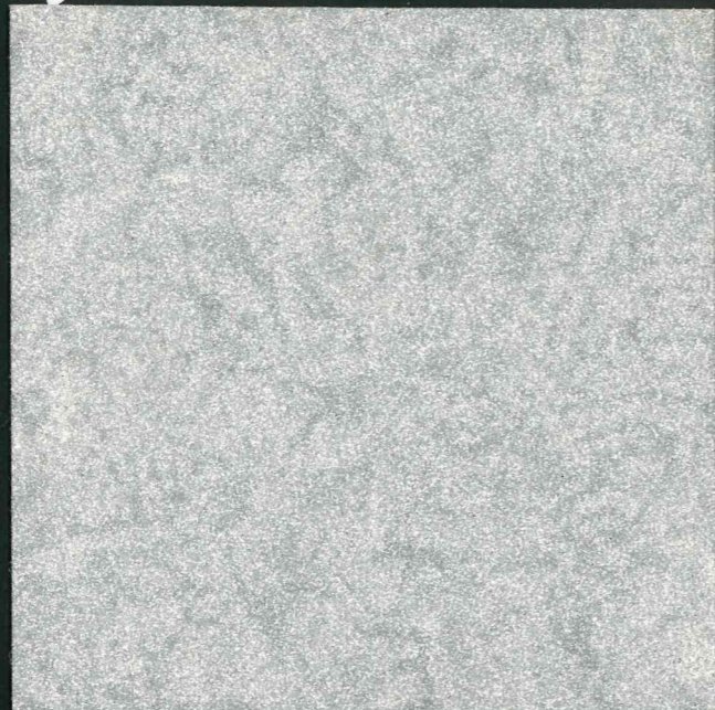
Silver Multi crystal on white vinyl silk