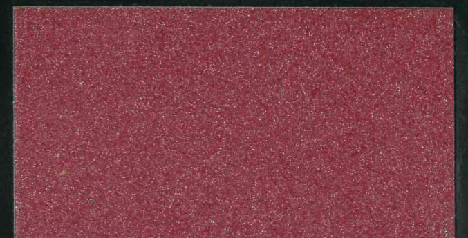
NP 114.4 on aracyl Khamri