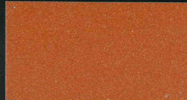
NP 111.2 on aracyl 220