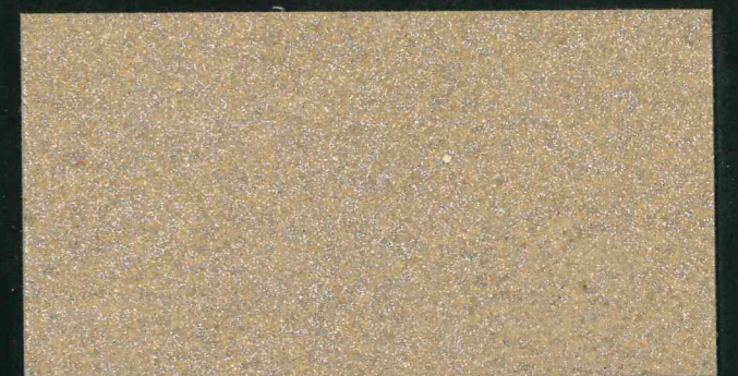
NP 99.1 on aracyl 213