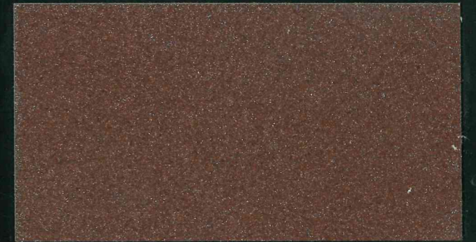
NP 116.4 on aracyl 219