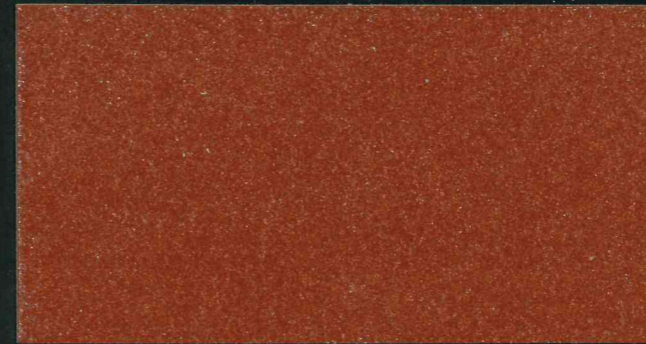
NP 116.1 on aracyl 223